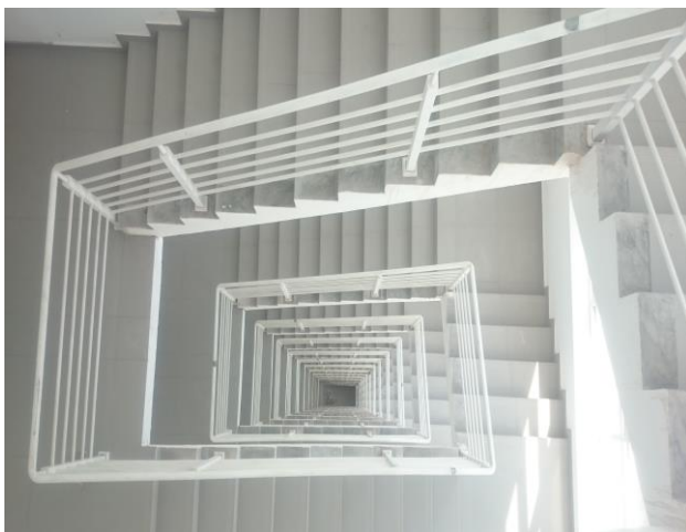
Fire Staircase Final Finishing Works