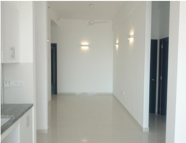
Final Finishing Work in Apartment Units