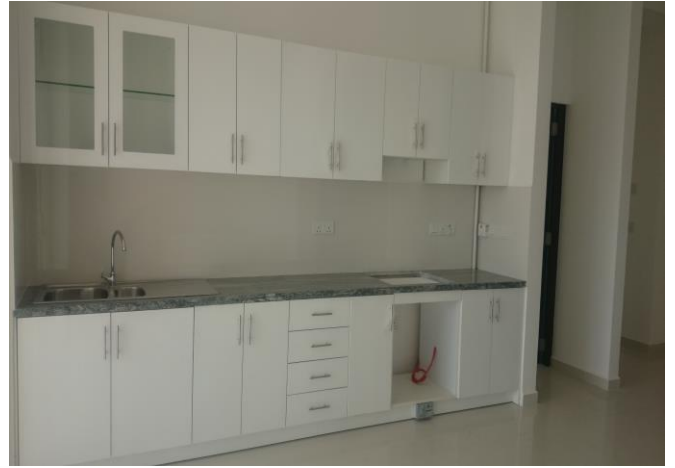
Pantry Finishing Work