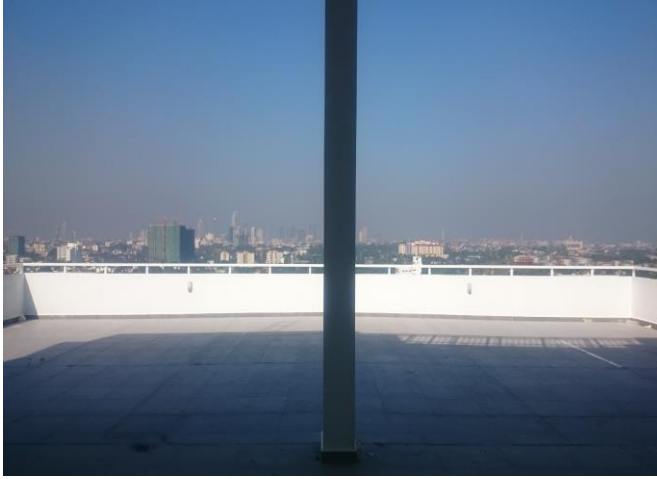
Roof Terrace Finishing Works