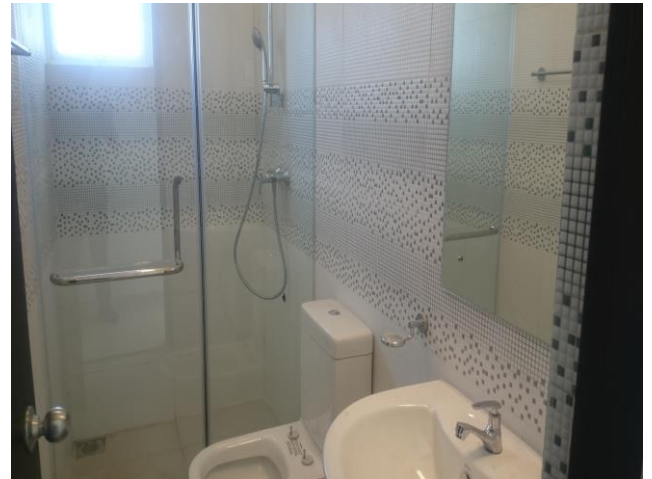
Bathroom Finishing Work