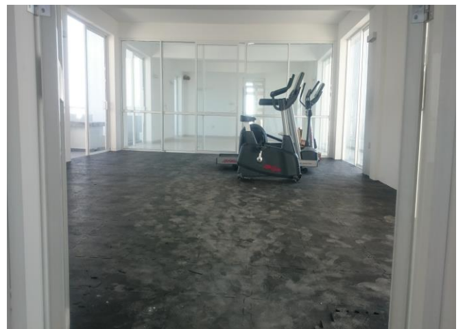
Gym Equipment Installation works on Progress