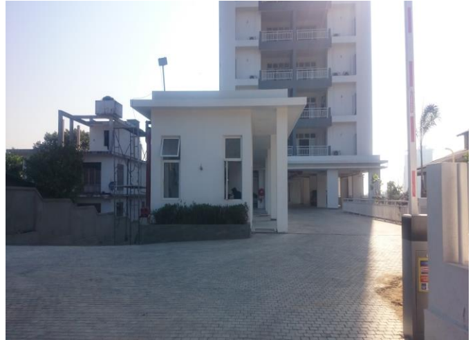
Entrance area Finishing Works