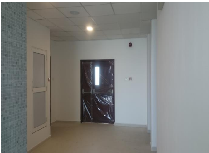
Common Lobby Area Finishing Works