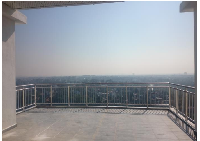
Pool Deck Final Finishing Works