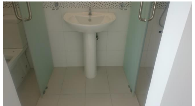
Bathroom Finishing Work