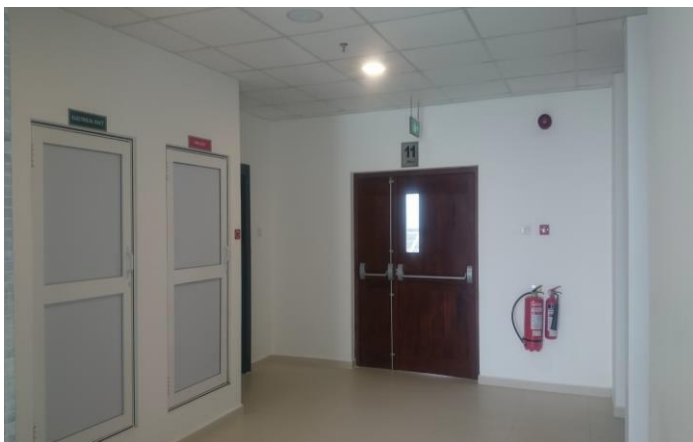
Common Lobby Area Finishing Works