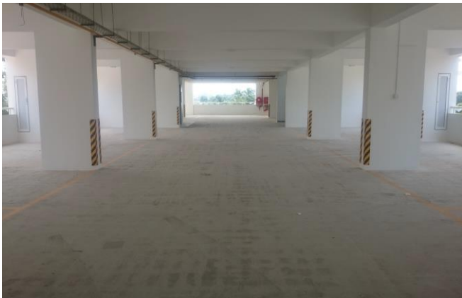
Parking floor Finishing Work