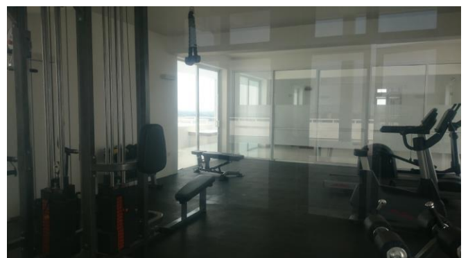
Gym Equipment Installation works on Progress