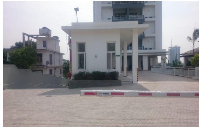
Entrance area Finishing Works