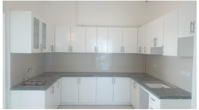
Pantry Finishing Work