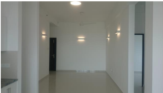
Final Finishing Work in Apartment Units