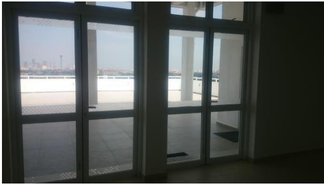
Roof Terrace Finishing Works