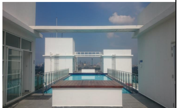
Pool Deck Final Finishing Works