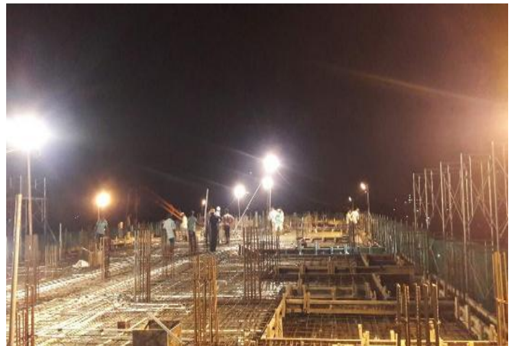
Casting 6 th floor slab