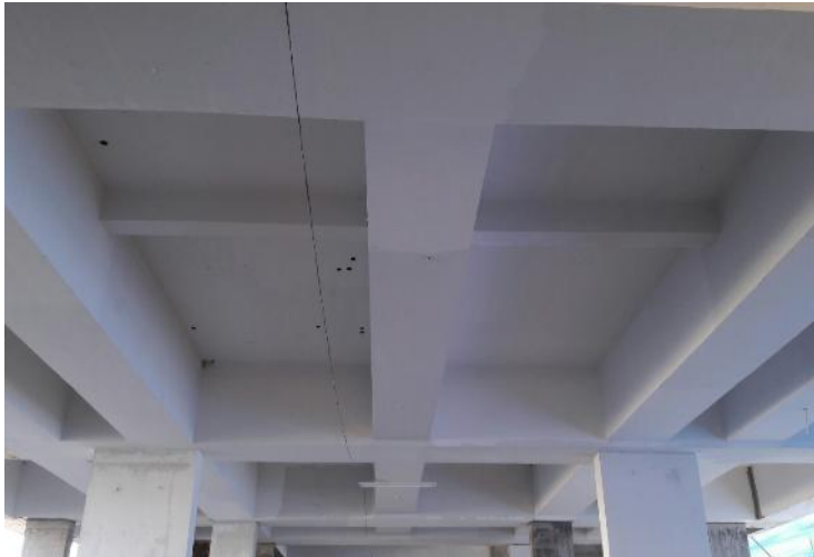
Painting @ 1 st floor