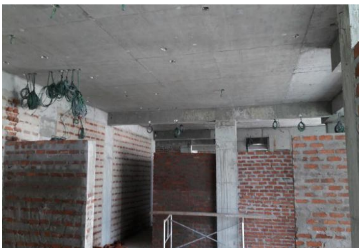
Brick work @ 3 rd floor