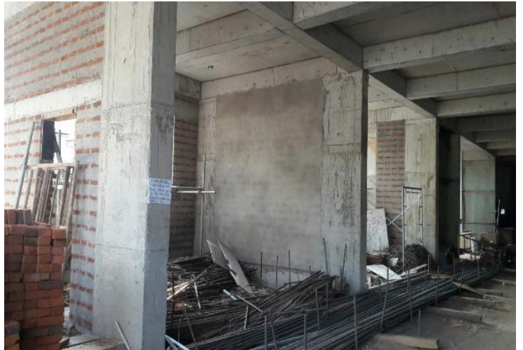
Brick work & plaster @ g.f