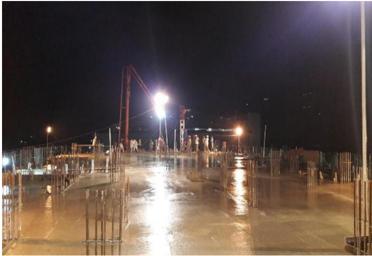
Casting 6 th floor