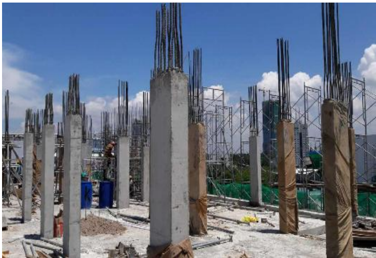
Column concret @ 5 th floor