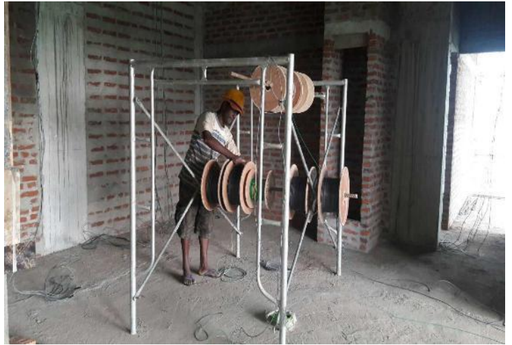
Wiring @ 2 nd floor