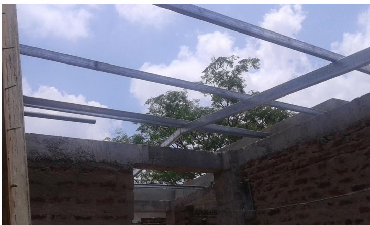
Roof work lot 04