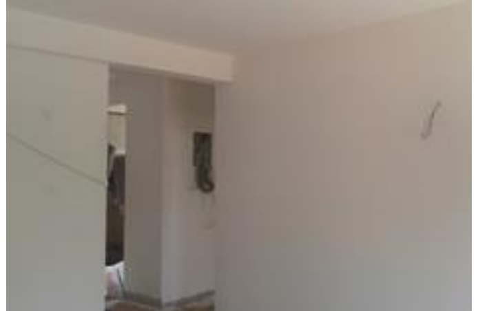
3 rd Floor Painting lot 08