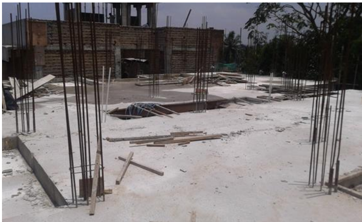
5 th Floor slab