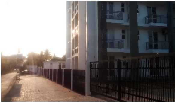
Figure 1.3: Building Entrance