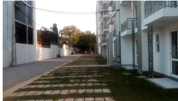
Figure 1.4: Car parking Area