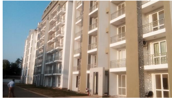
Figure 1.2: Rear view