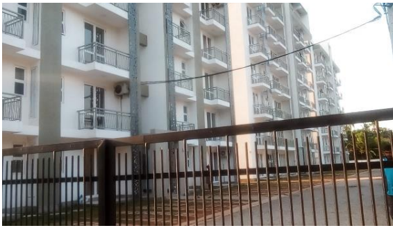
Figure 1.1: Front view