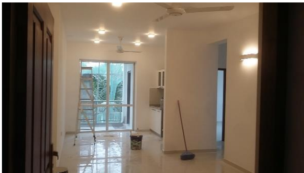
Figure 1.5: House Ready for Handover