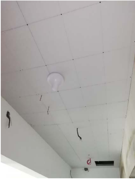
Figure 5 – Fixing Lobby Ceiling at 10 th Floors