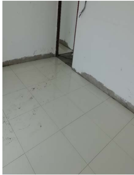
Figure 6 – Bed Room Tiling at 12 th Floor