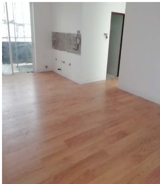
Figure 4 - Timber Flooring ( Sample)