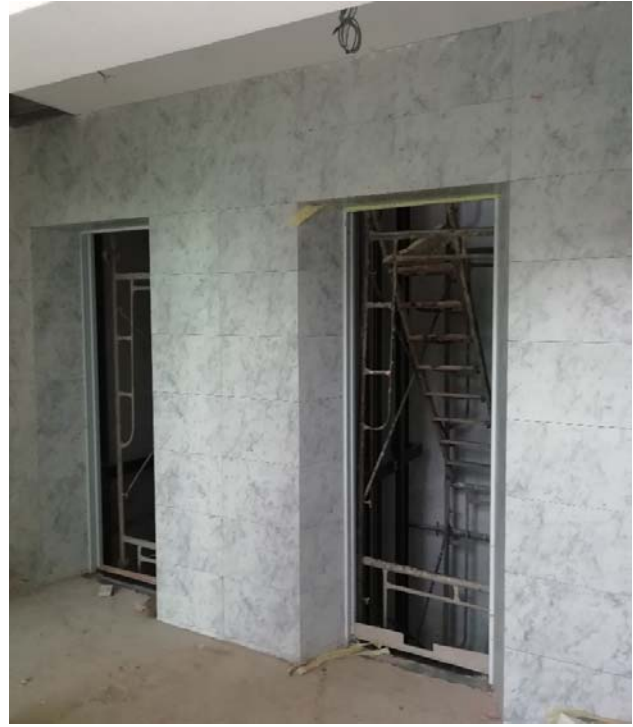
Figure 2 - Lift Wall Tiling