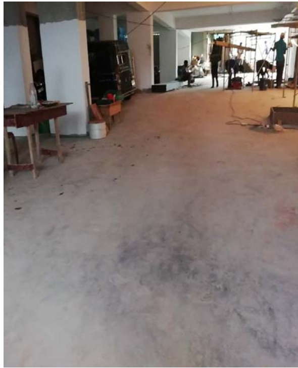
Figure 1- Floor Concreted at Ground Floor