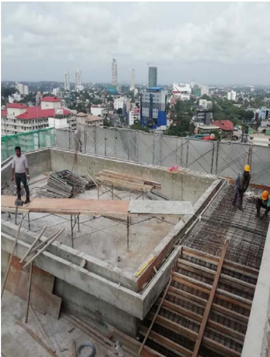
Figure 7– Swimming Pool Construction