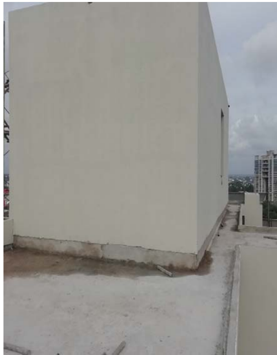
Figure 8 – External Painting over the Roof Top