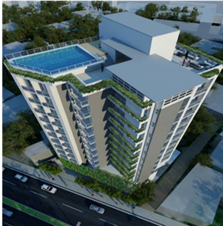
FIGURE 1.1: Proposed Apartments building at No.170, Castle Street, Colombo 08

CIVIL CONTRACTOR : N & A Engineering Pvt Ltd