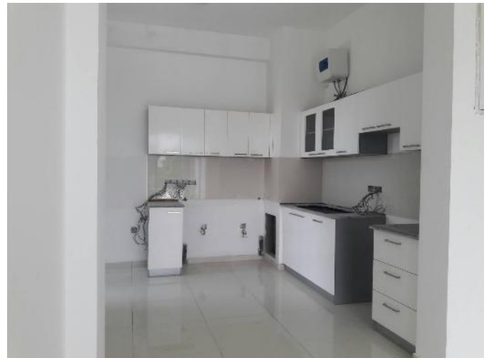
Type "A" Pantry area