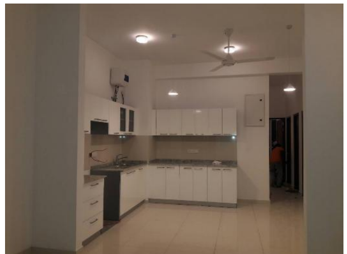
Type "C" night view