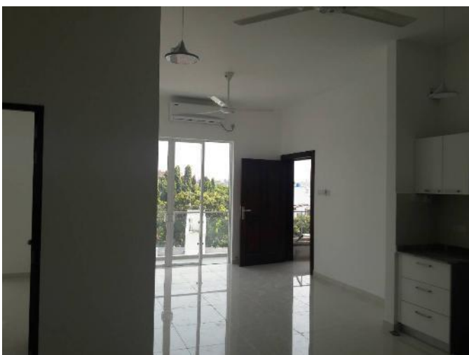
Type C finishes