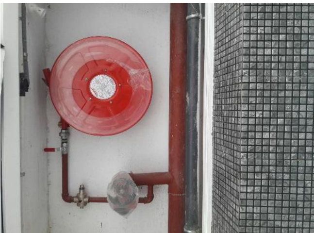
Fire fighting system