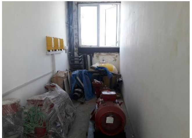
Fire/Pool Pumps installation