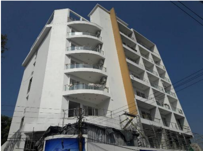
Front view from thimbirigasayaya end