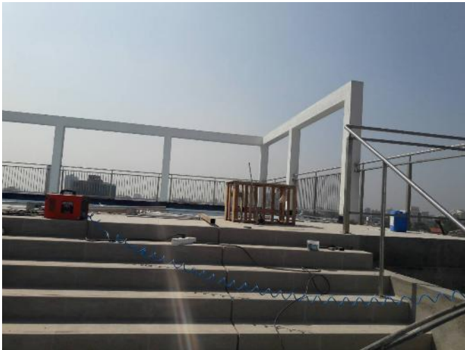
Pool Deck & handrail fixing