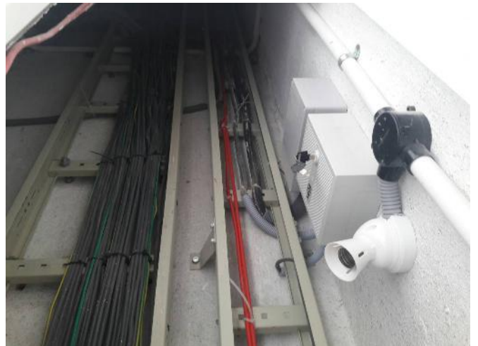
Electrical & ELV service duct