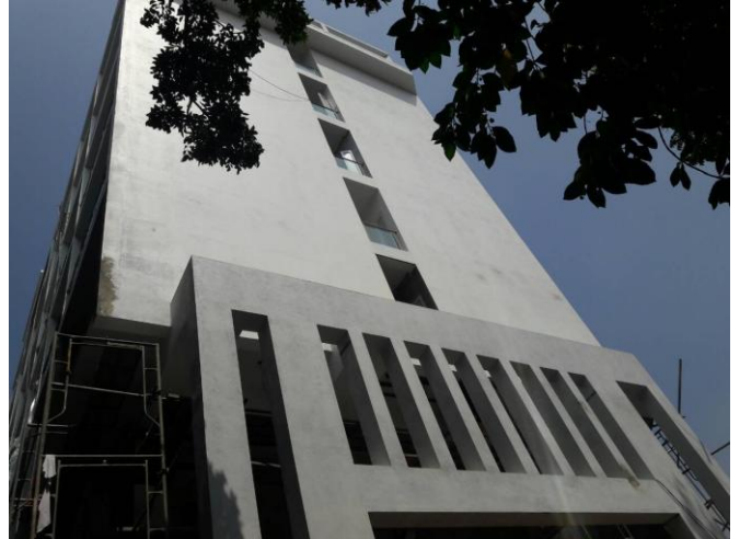
View from Donkarolis road end