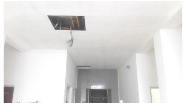
Roof Terrace and Common Lobby