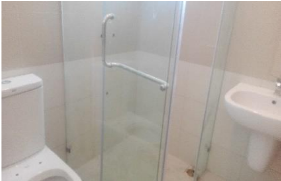
Bath Room Tiling, Fitting Fixing, Shower Cubical