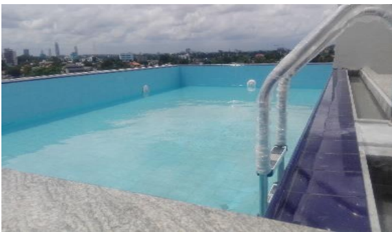
Swimming Pool View