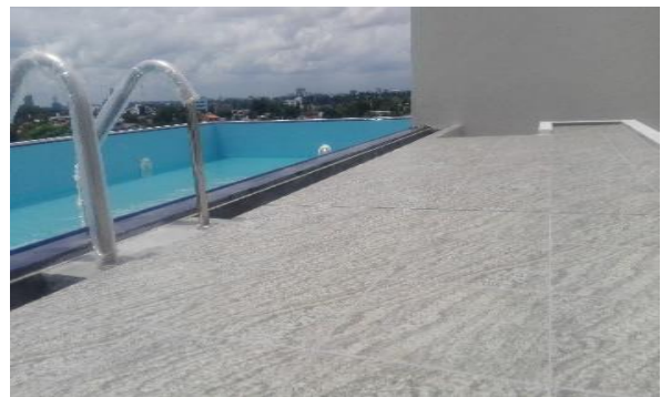
Swimming Pool View