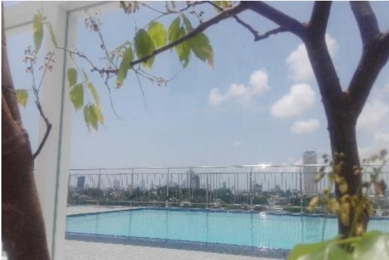
Swimming Pool View