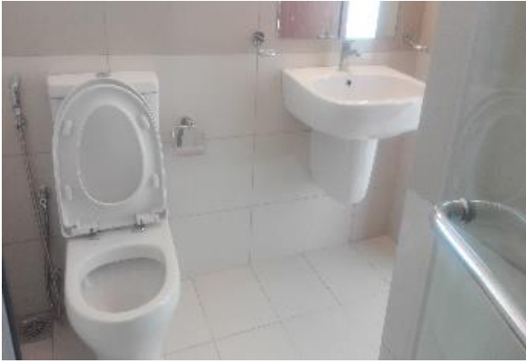
Toilet Finish View