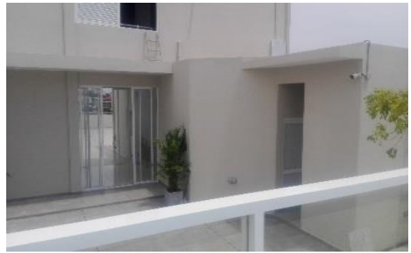
Roof Terrace View