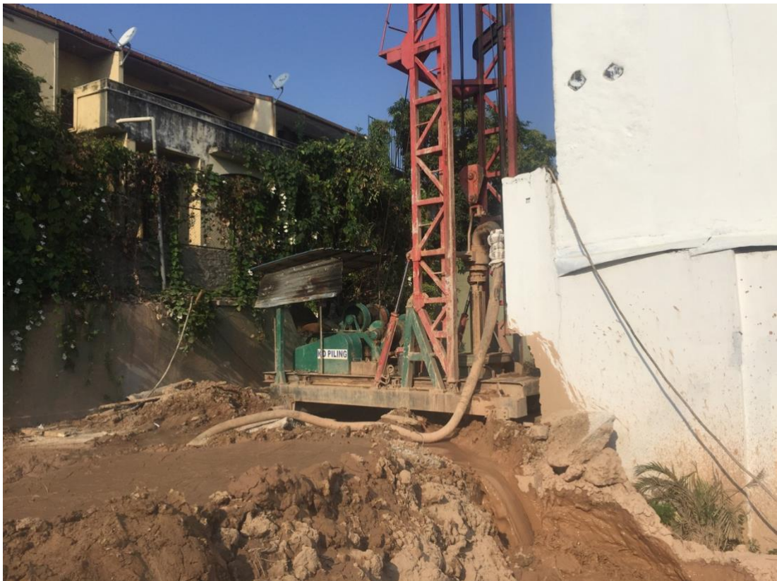
Figure 03 – Pile Boring