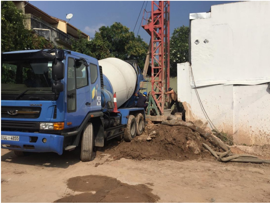
Figure 03 – Pile Concreting