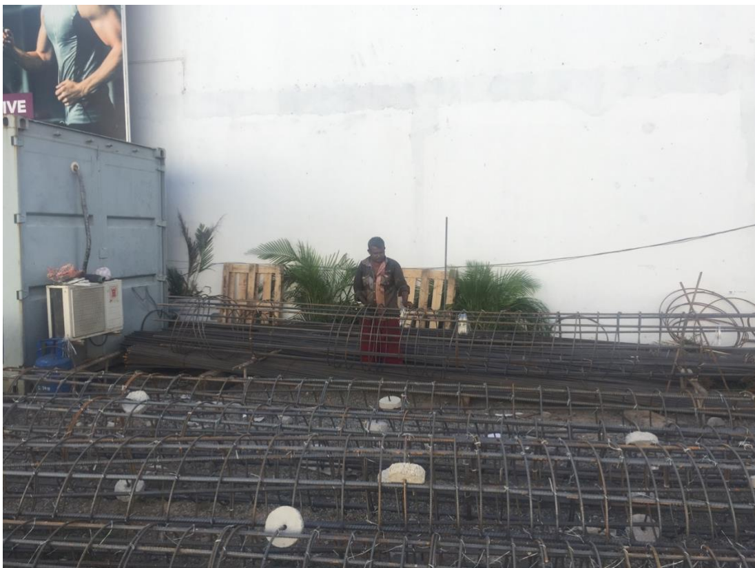
Figure 03 – Rebar Fabrication