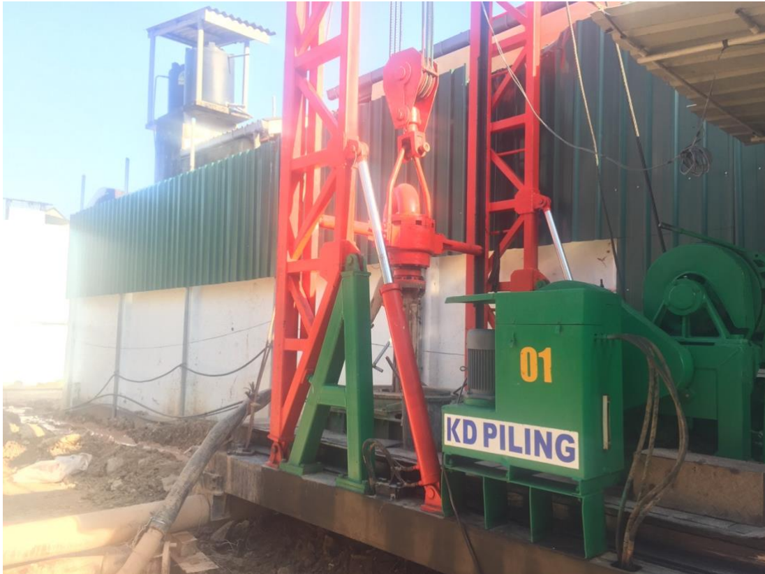
Figure 02 – Pile Boring