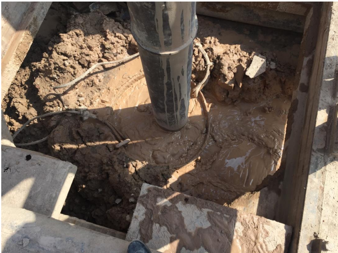
Figure 03 – Pile Cleaning