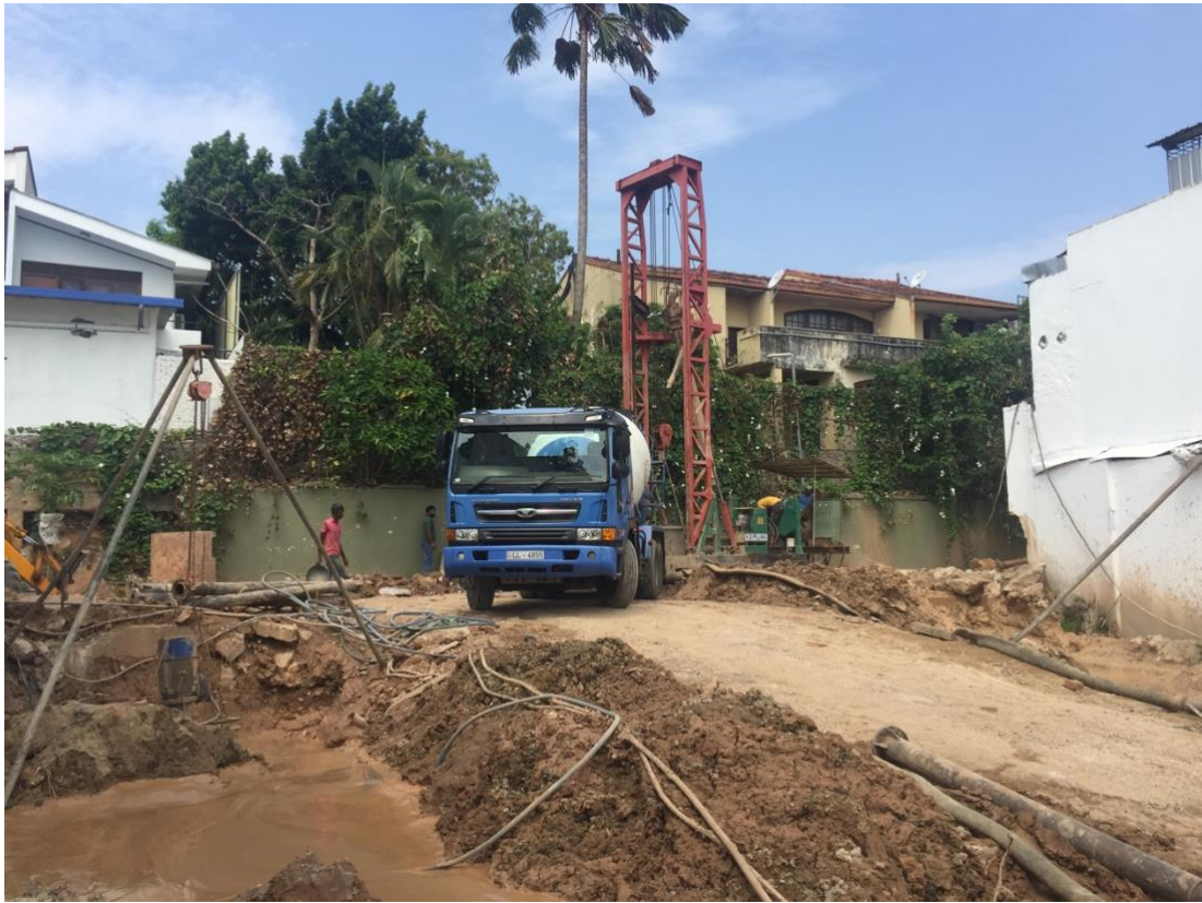
Figure 03 – Pile Concreting