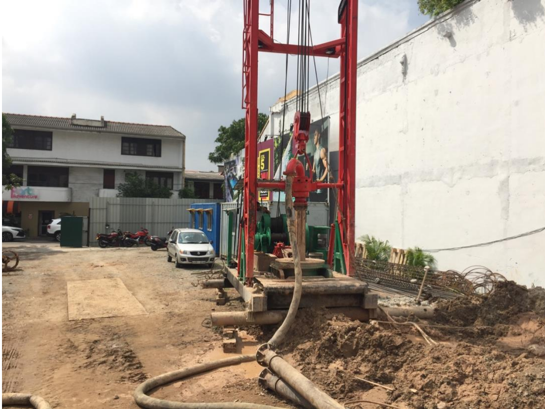
Figure 02 – Pile Boring