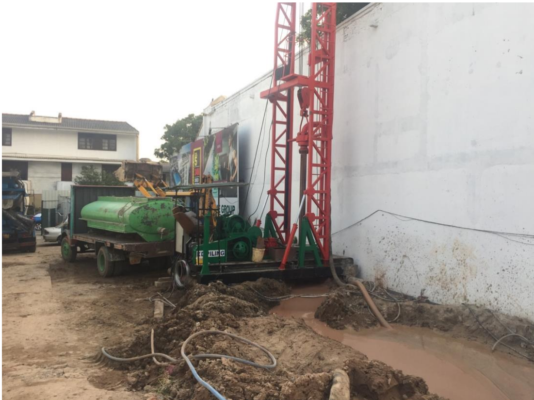
Figure 03 – Pile Boring