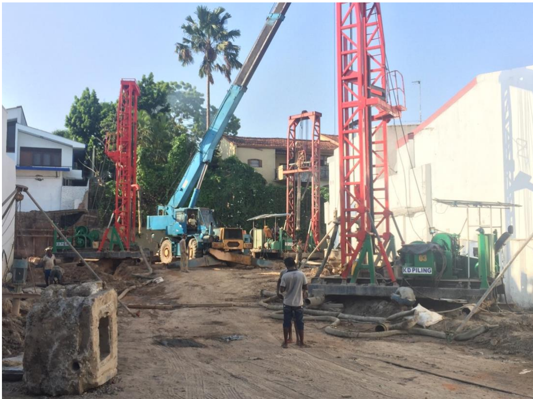
Figure 03 – Site View