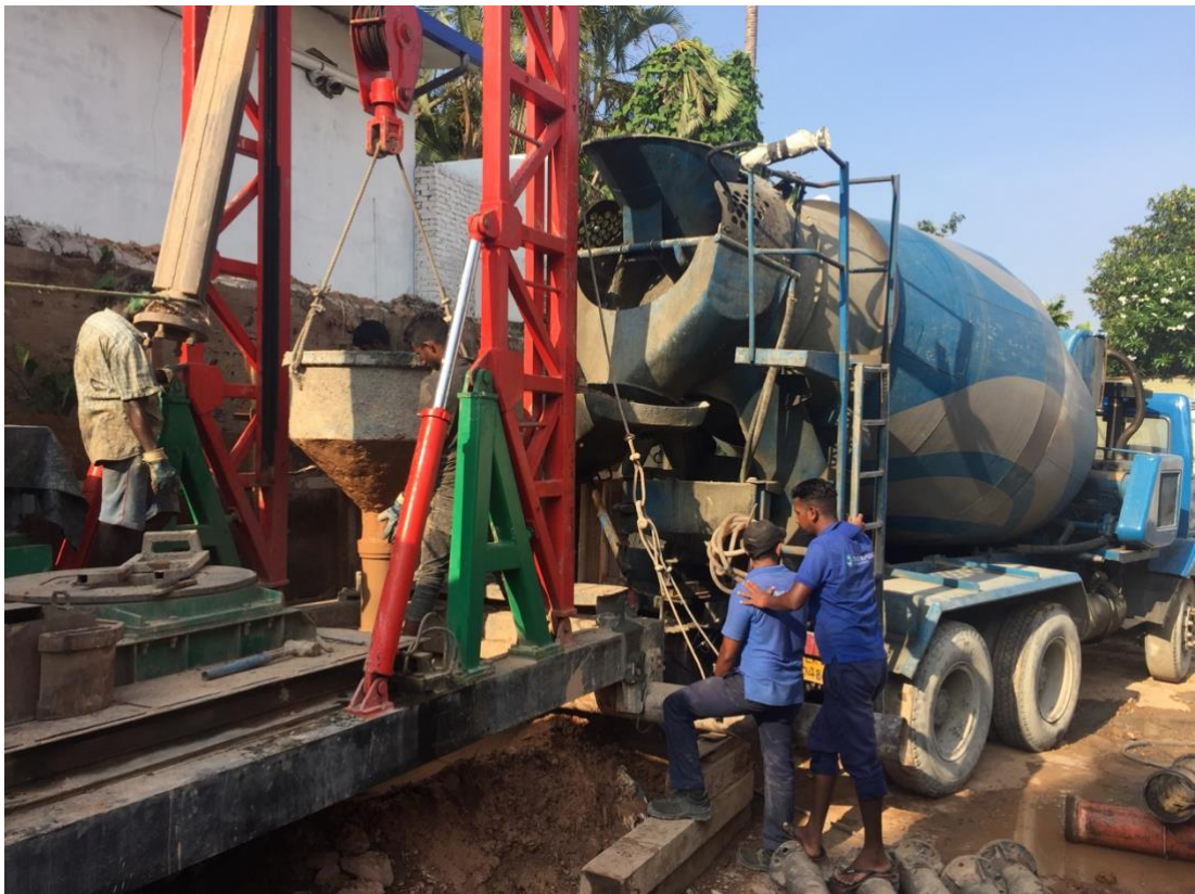
Figure 03 – Pile Concreting