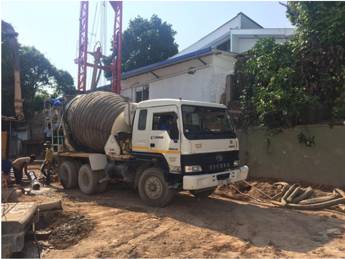
Figure 03 – Pile Concreting