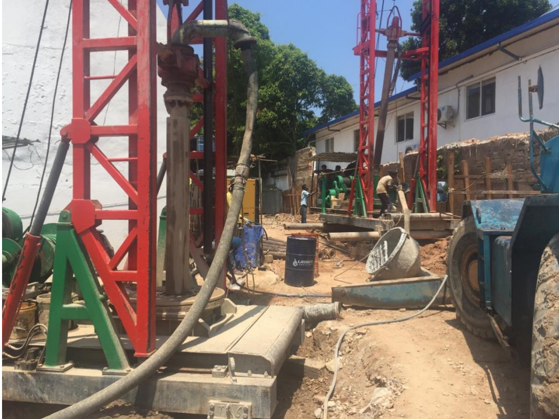
Figure 02 – Pile Boring