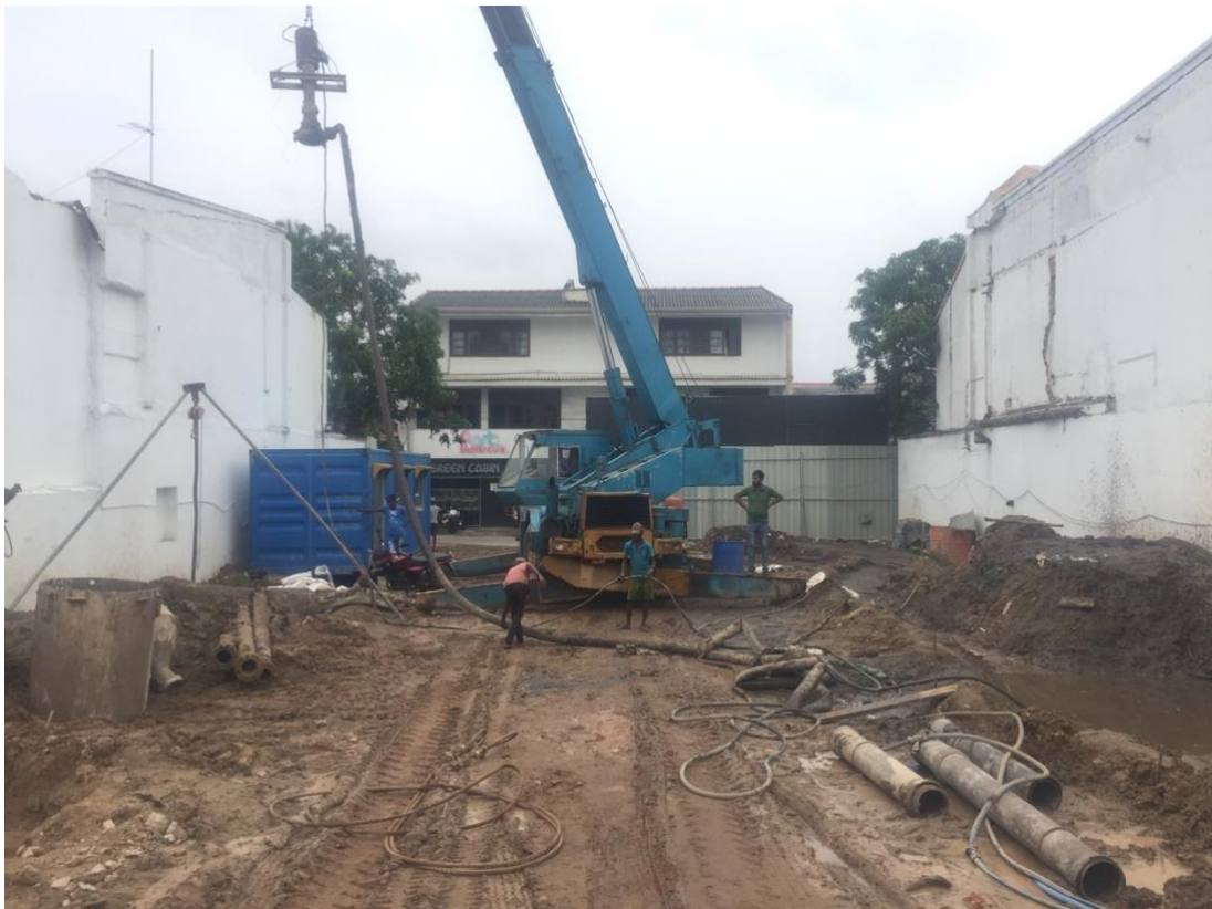
Figure 03 – Site View