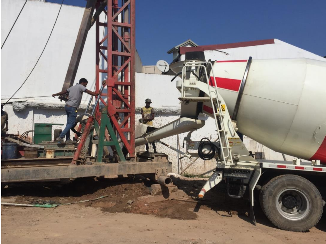
Figure 02 – Pile Concreting