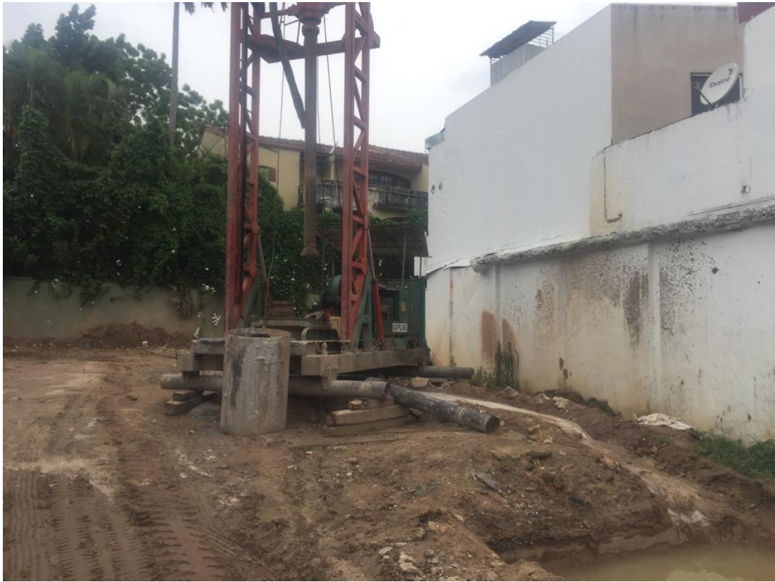
Figure 03 – Site View