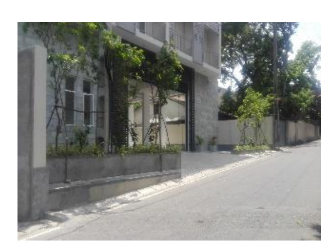
Site Main Entrance View