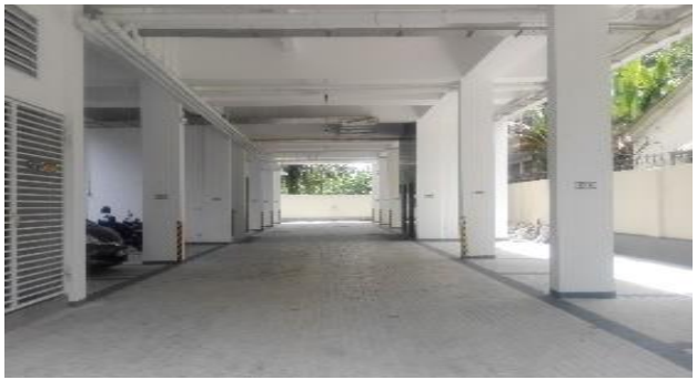
Common Lobby and Car parking View