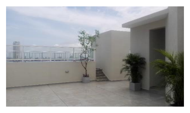
Roof Terrace View