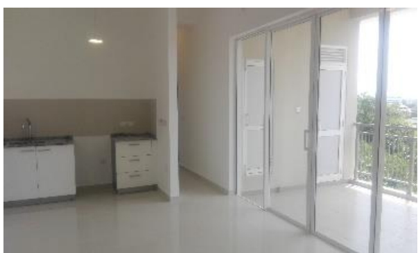
House Inside View