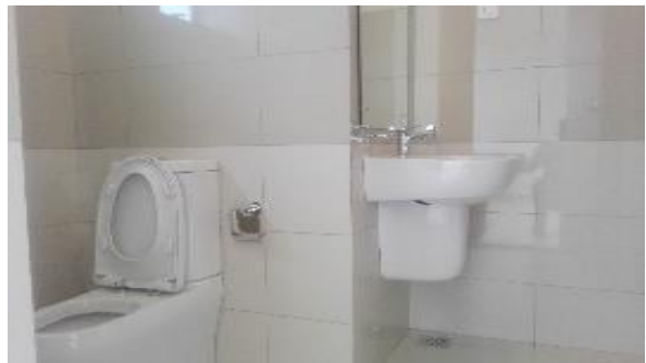
Toilet Finish View