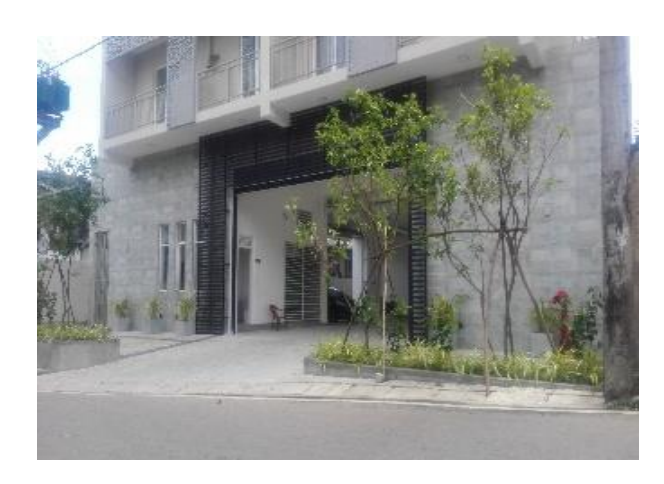
Site Main Entrance View