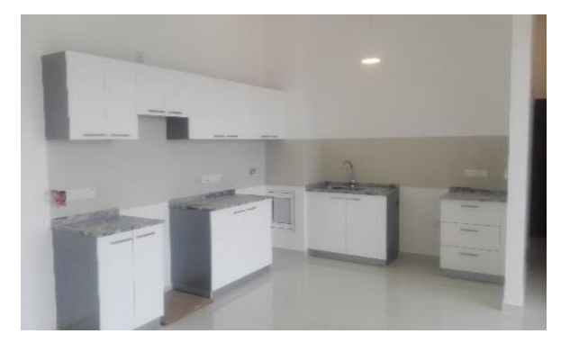
House Inside View