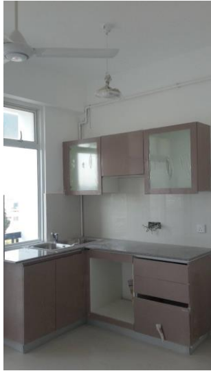
Pantry at Type F