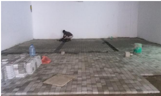
Paving Work at Lower Ground Level