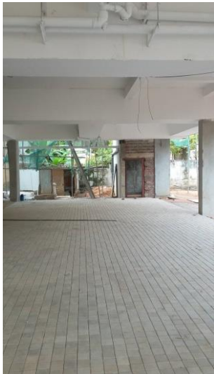
Paving at Ground Floor