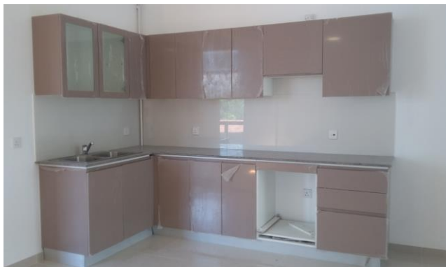
Pantry at Type E