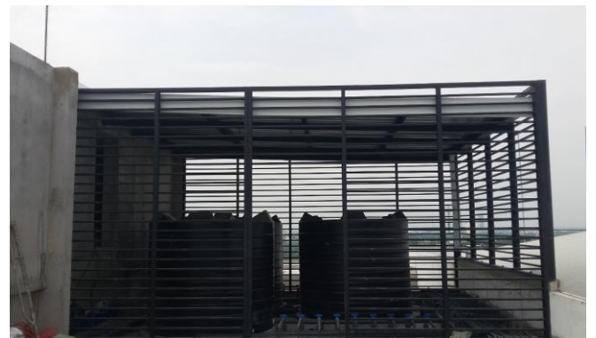
Placing Over Head Water Tank