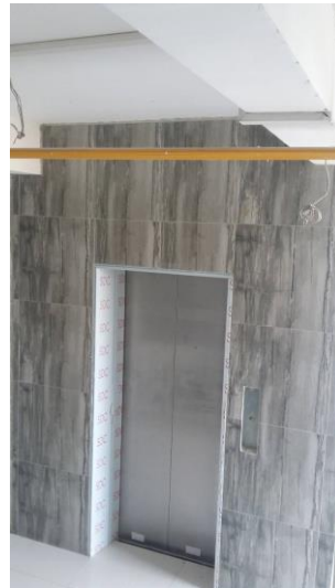
Lift Wall Tiling