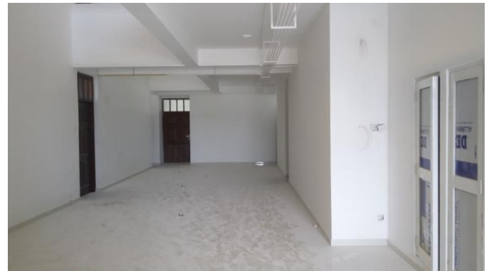
Lobby at 1 st Floor