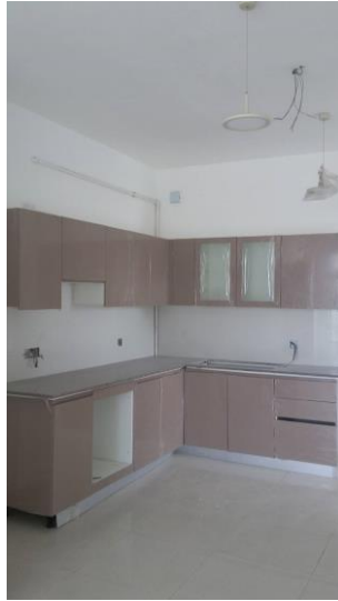
Pantry at Type A