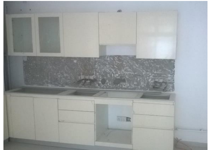
Pantry cupboards fixing