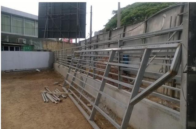
Front fence work WIP