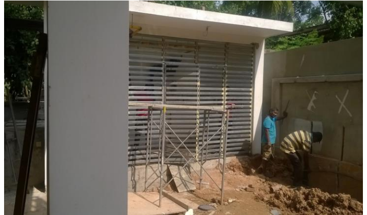
Gas room construction WIP