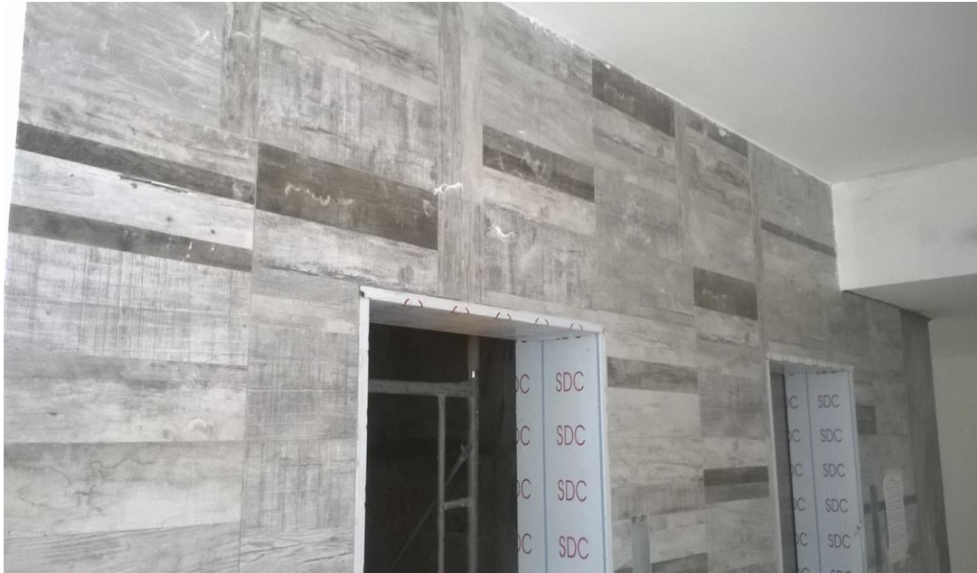
Lift wall tiling