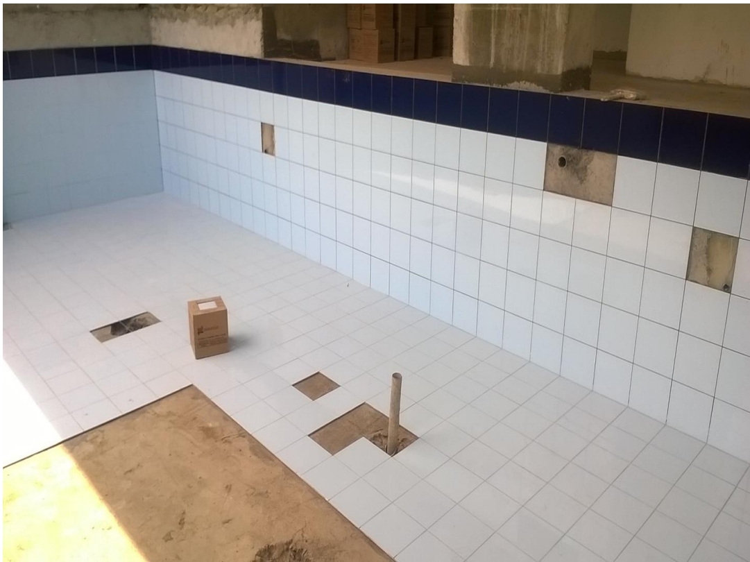
Swimming Pool Tiling