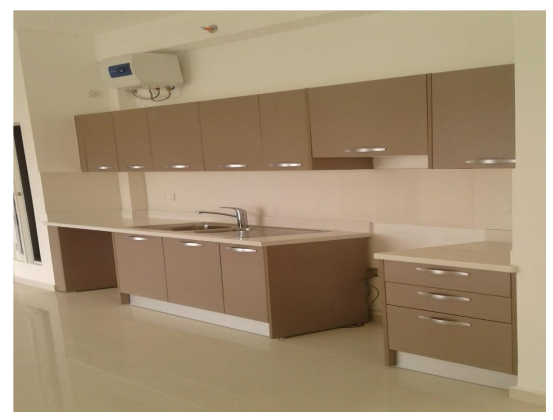
Figure 11- Inside Apartment