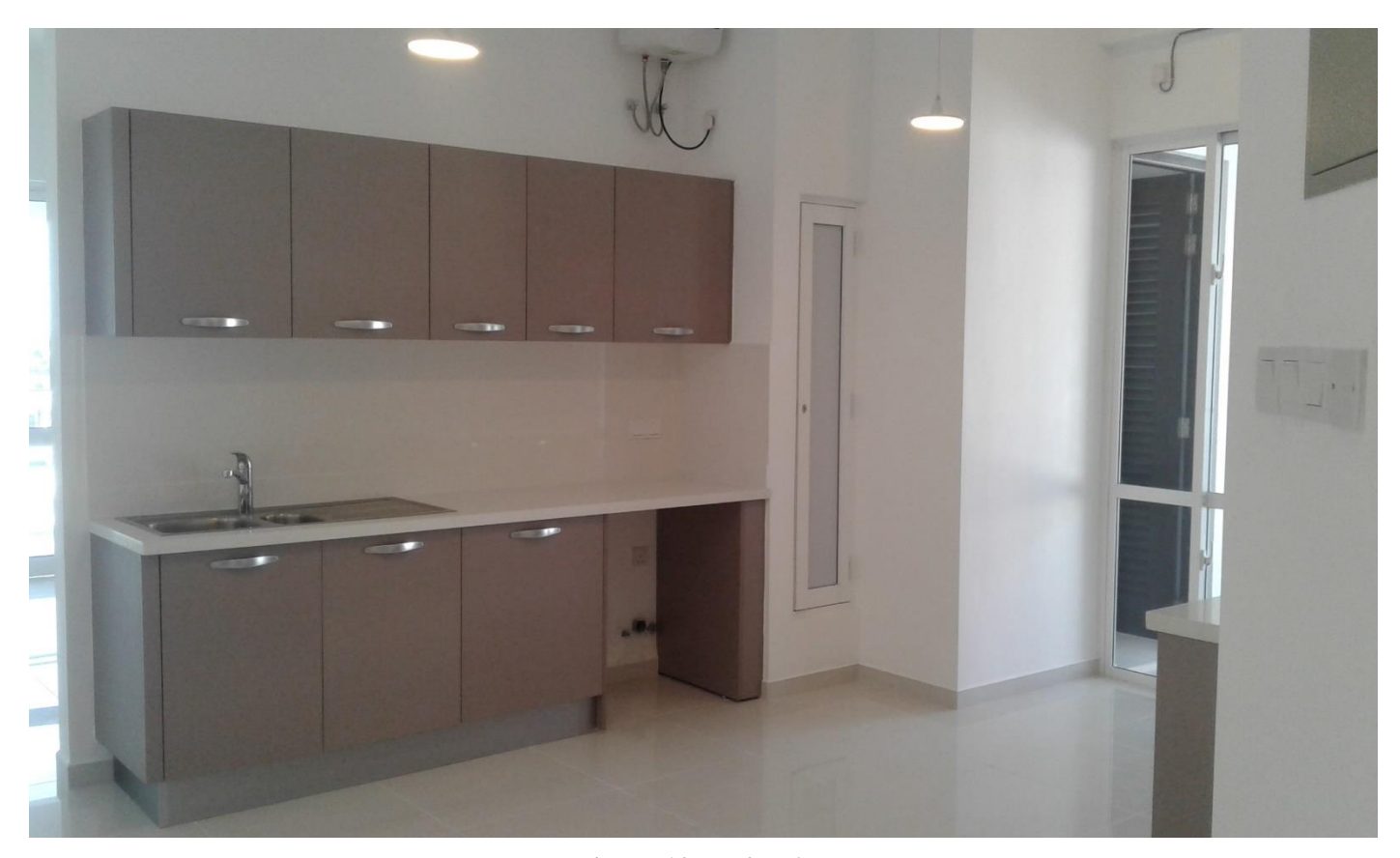
Figure 10- Inside Apartment