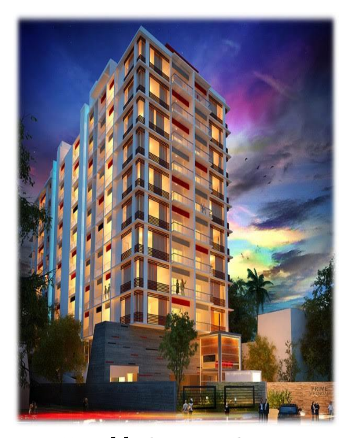
Monthly Progress Report May-2019

No 270, Sri Jayawardanapura MV, Rajagiriya