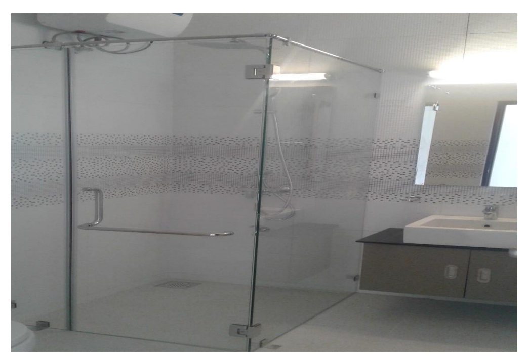
Figure 03- Bathroom Inside