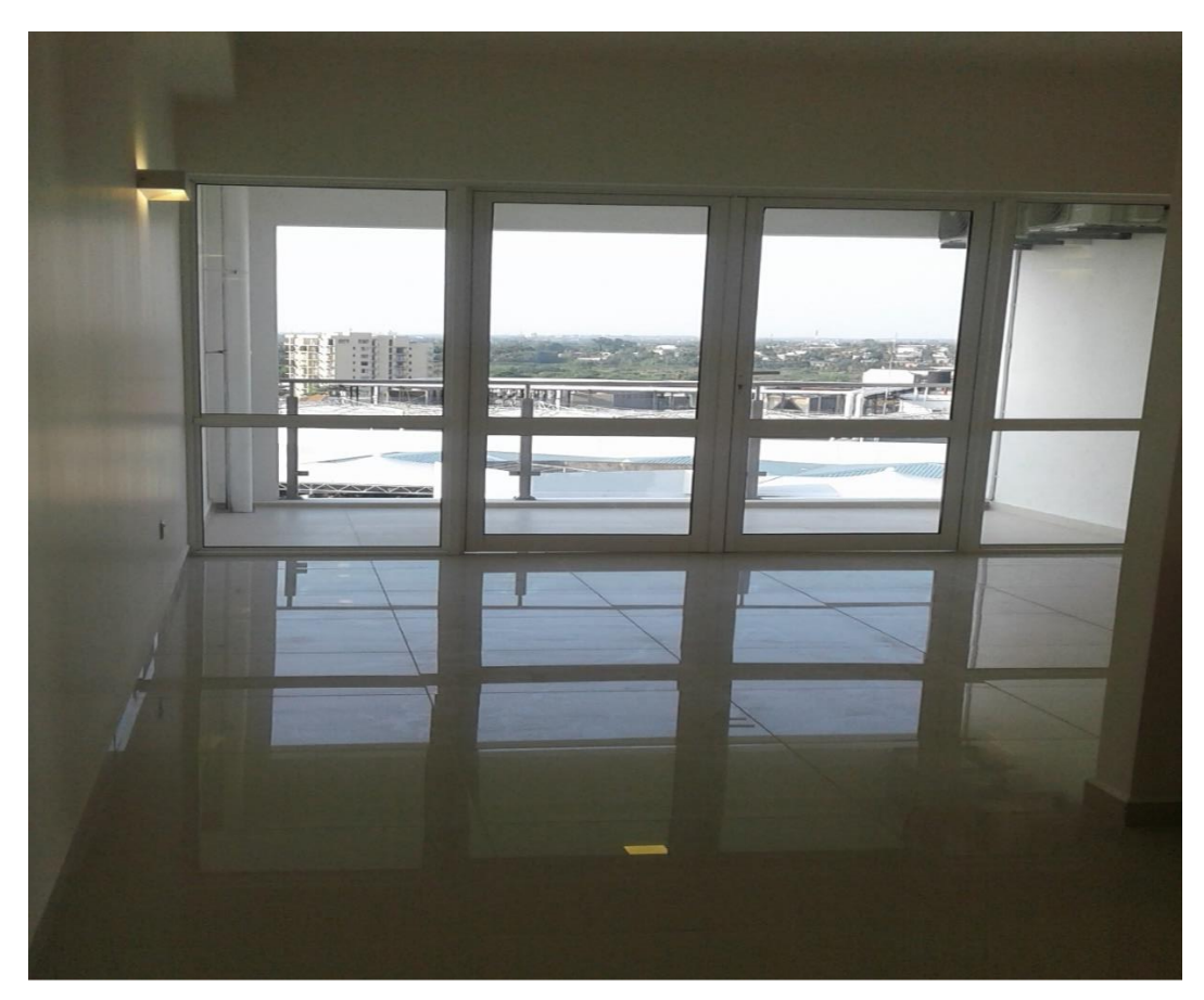
Figure 12 - Inside Apartment