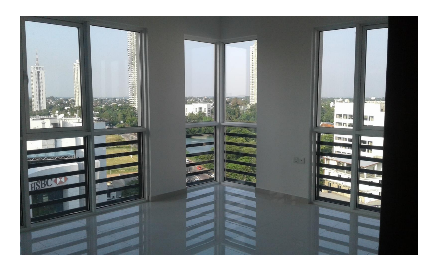
Figure 09- Inside Apartment