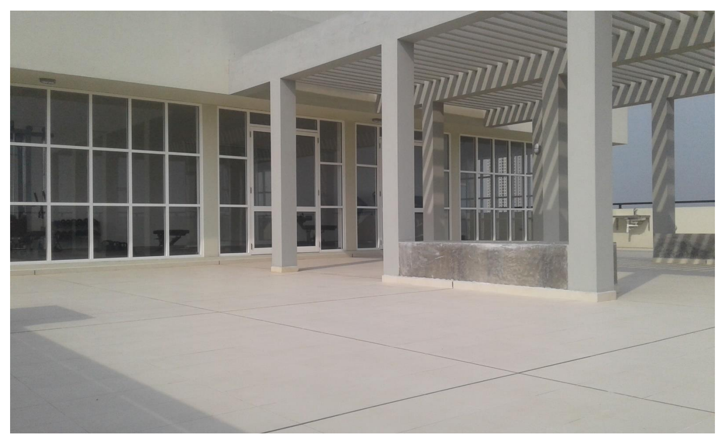
Figure 06- Roof Terrace