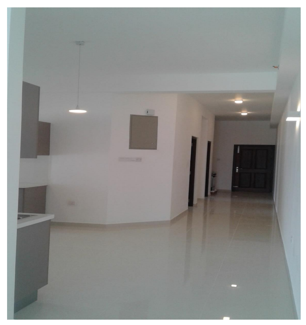
Figure 04- Inside Apartment