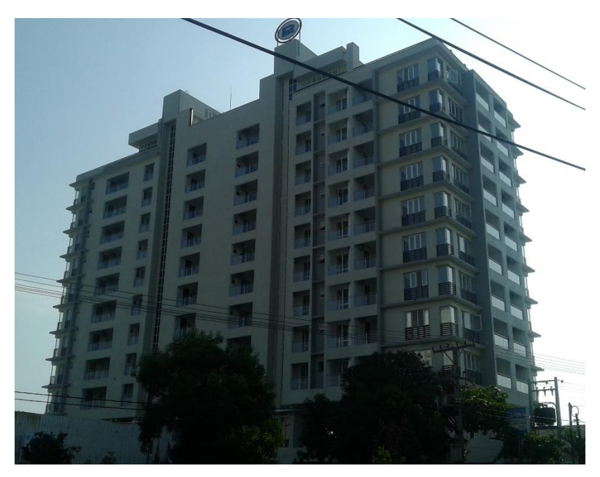
Figure\ 01-Side\ View\ of\ the\ Building