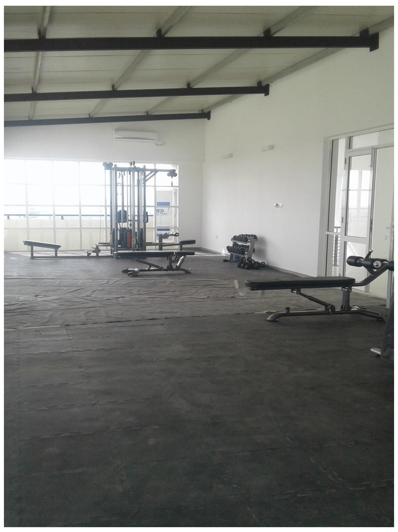
Figure 08- Gymnasium