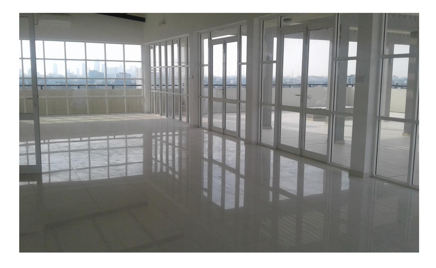
Figure 07- Roof Terrace