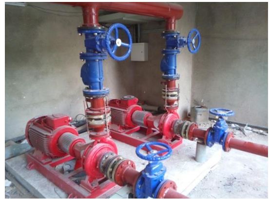
PUMPS IN GF