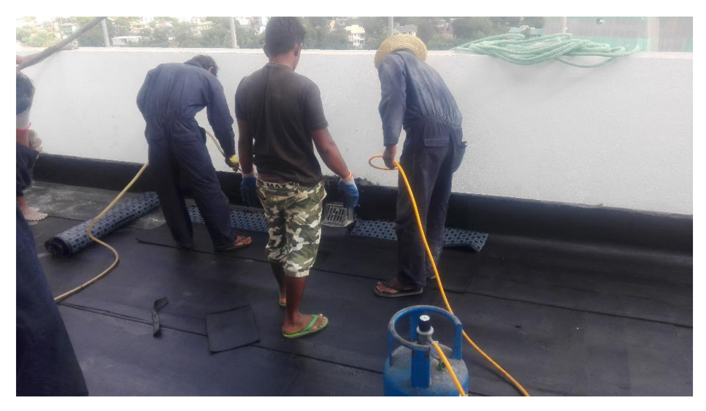
Figure.10 – Roof Terrace Waterproofing