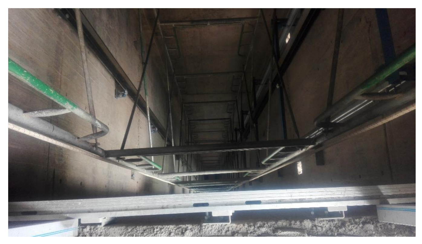
Figure.07 – Lift Installation