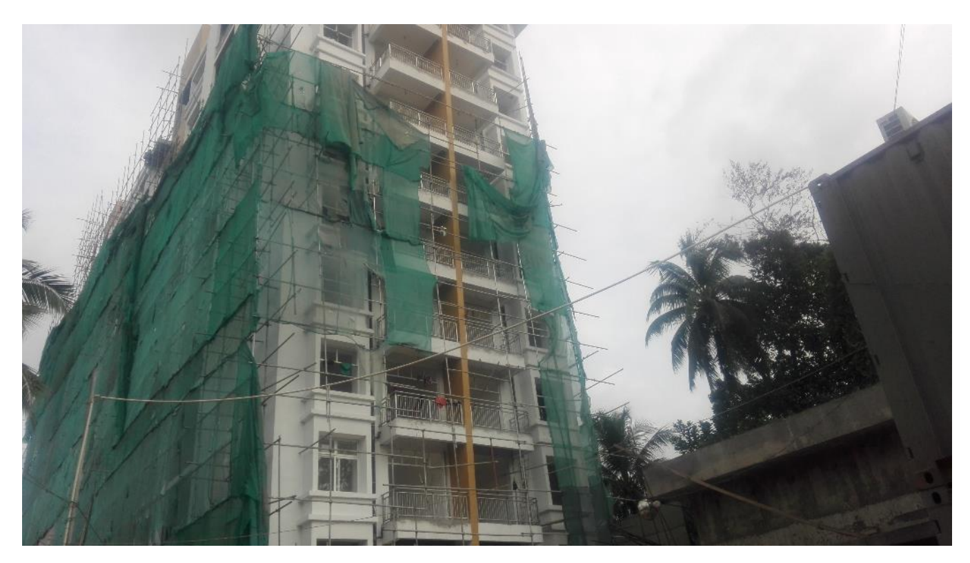
Figure.01 – Front View