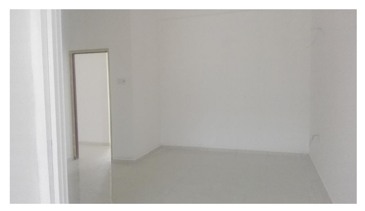
Figure.05 – Bed Room after Initial coat of Paint