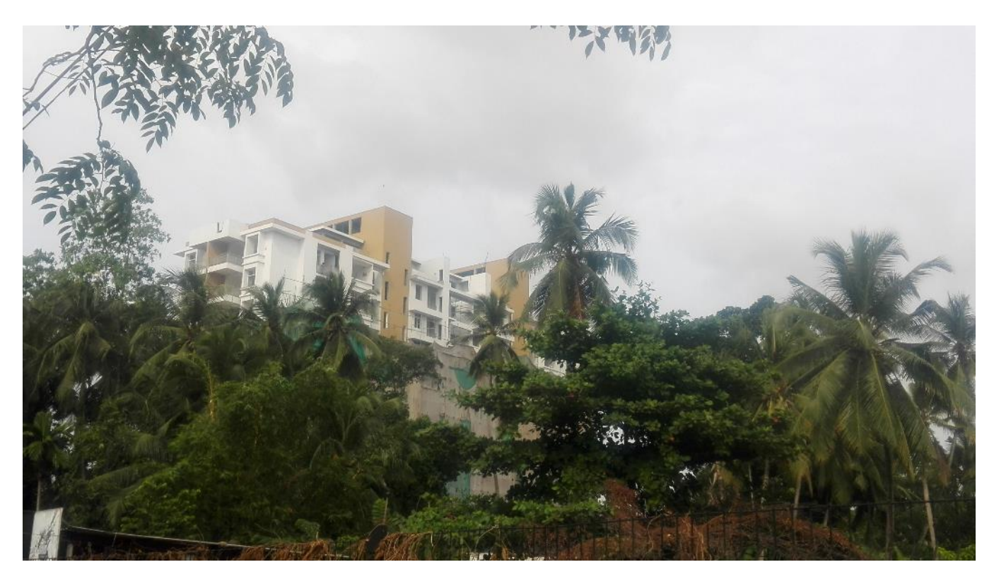
Figure.02 – View near Laksiri Supermarket