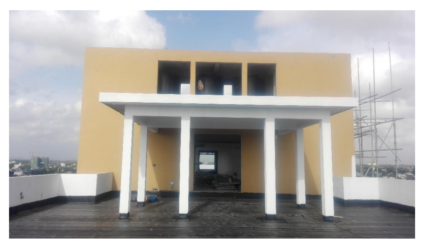
Figure.04 – Roof Terrace