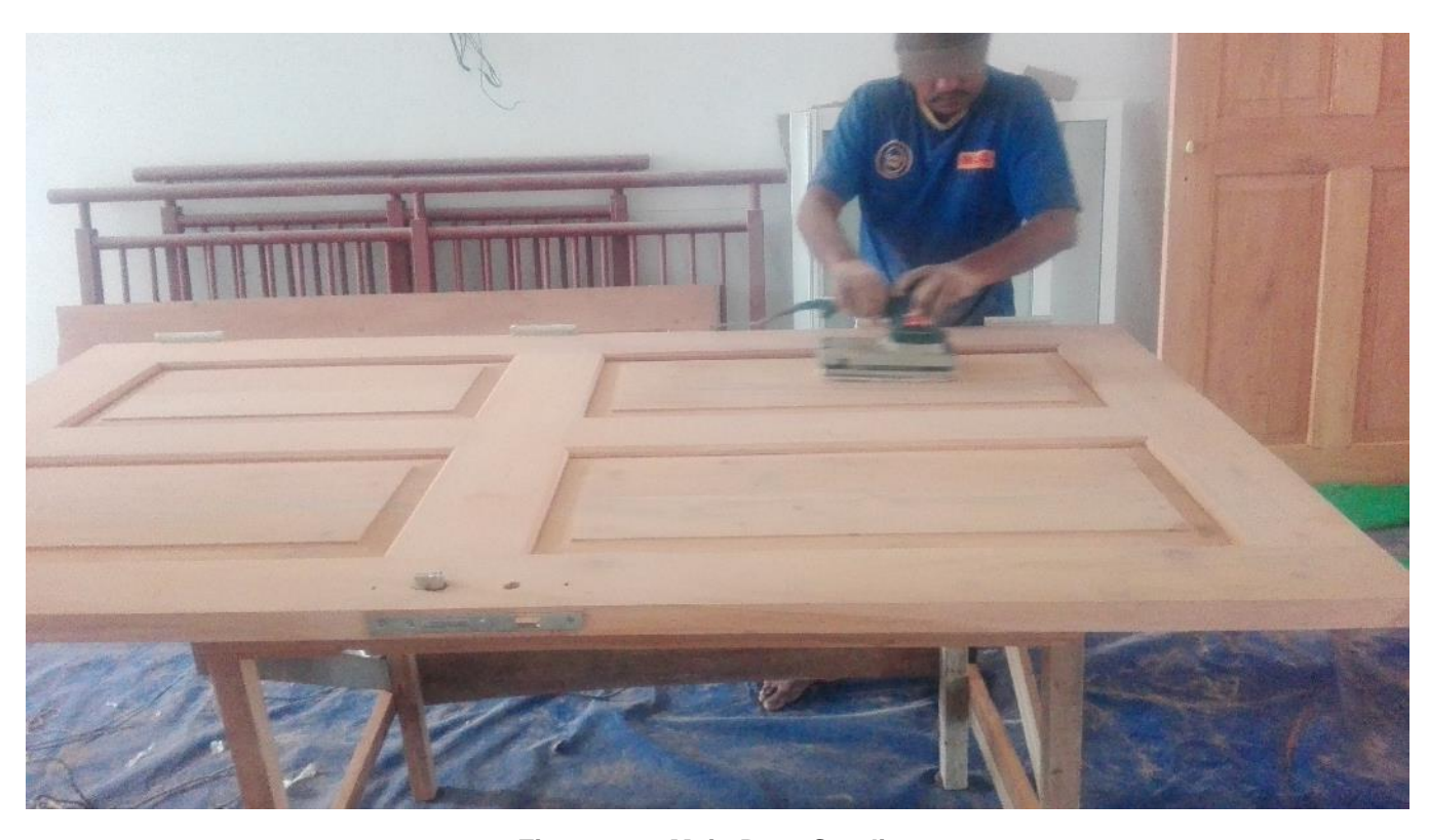
Figure.06 - Main Door Sanding