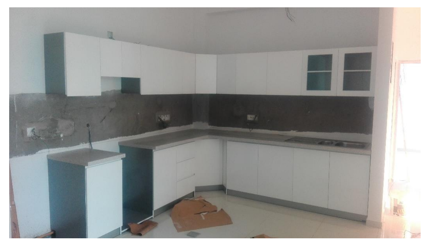
Figure.03 - Pantry Cupboards