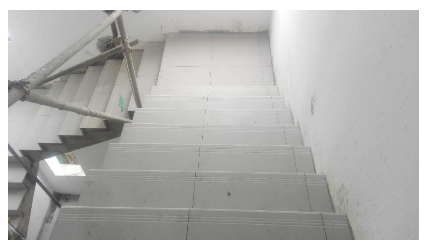
Figure.08 – Staircase Tiling