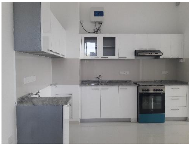
Figure 1.13: Type A Pantry