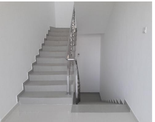
Figure 1.8: Staircase area