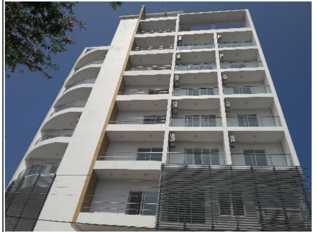
Figure 1.2: Front View