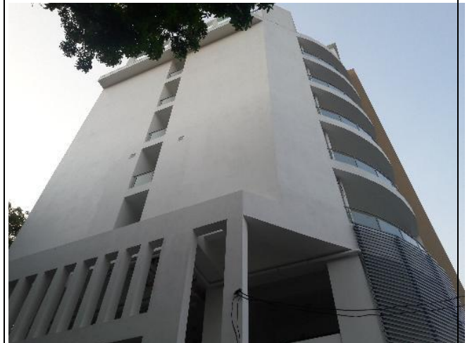
Figure 1.4: Side View