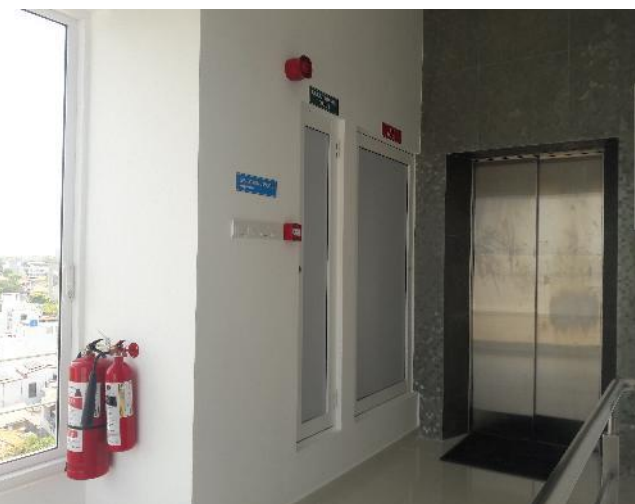
Figure 1.9: Lift Lobby