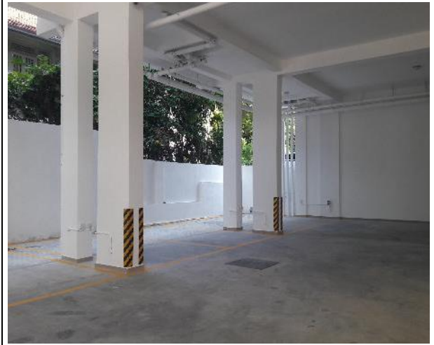
Figure 1.12: Parking Area