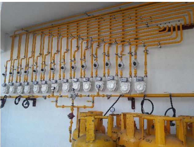
Figure 1.15: Gas Room