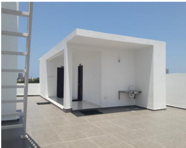
Figure 1.7: Changing Room