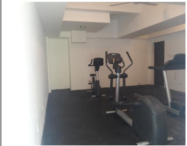
Figure 1.14: Gymnasium