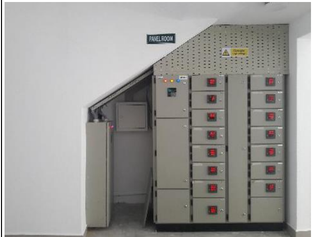
Figure 1.16: Main Panel Room