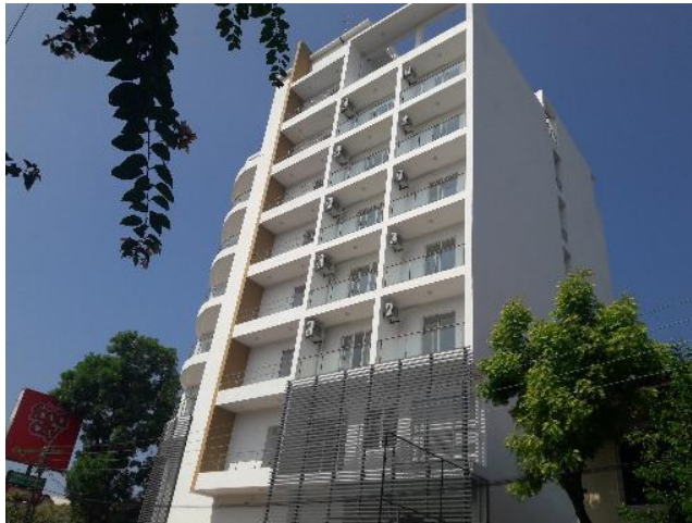
Figure 1.1 : Front View