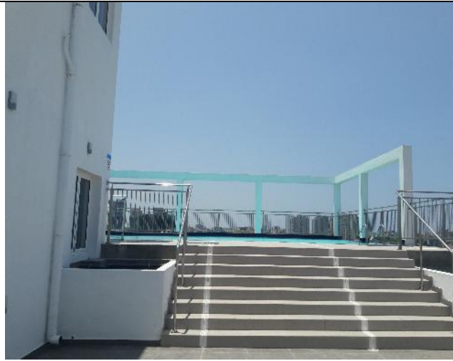
Figure 1.5: Roof Terrace