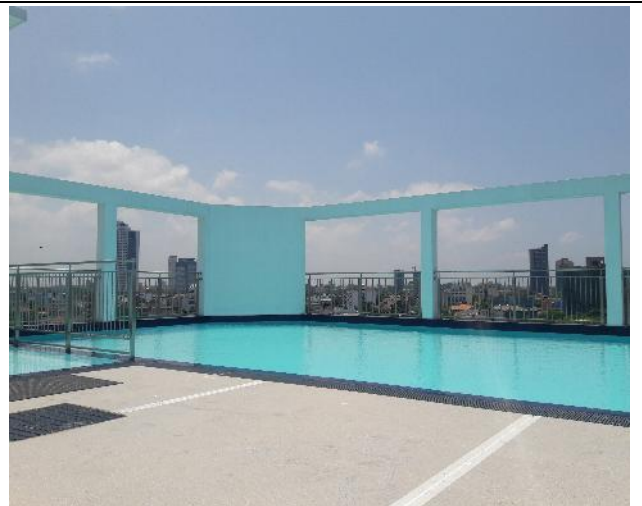
Figure 1.6: Pool