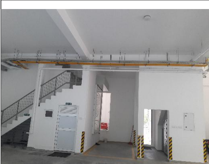
Figure 1.11: Parking Area