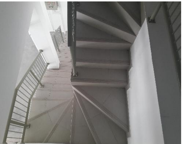
Figure 1.10: Gym Staircase entrance